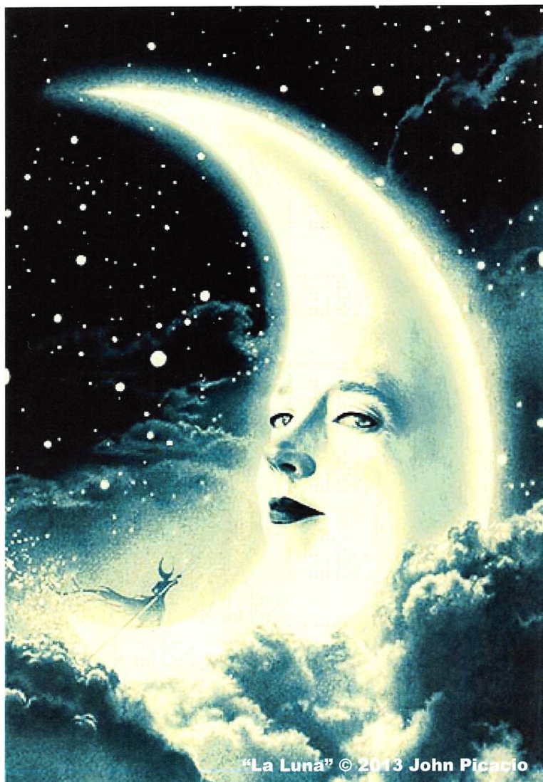
"La Luna" © 2013 John Picacio